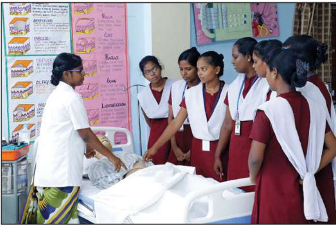
MEDICAL AND SURGICAL NURSING LAB