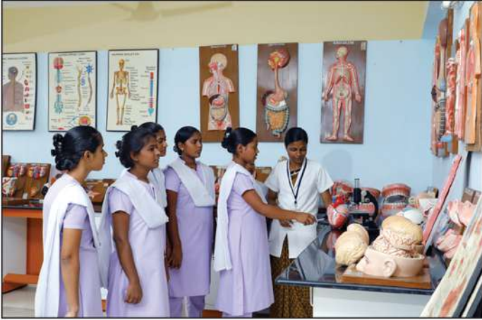
ANATOMY NURSING LAB

There are 6 labs available in the College. Demonstration of procedures will be carried out by the experienced faculty in the respective lab. Fully equipped laboratories aim at giving the students complete practical training in each department and also offers students the freedom to apply their knowledge and avail supremacy in their studies.