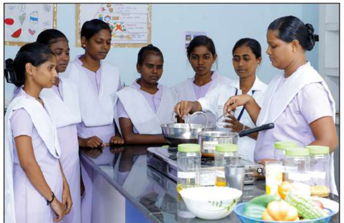
NUTRITION NURSING LAB