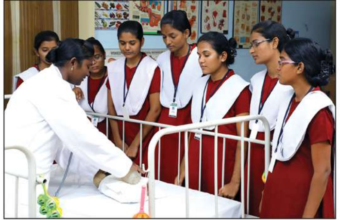
CHILD HEALTH NURSING LAB