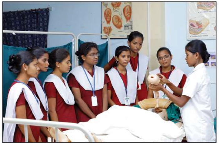
OBSTETRICS AND GYNAECOLOGY NURSING LAB