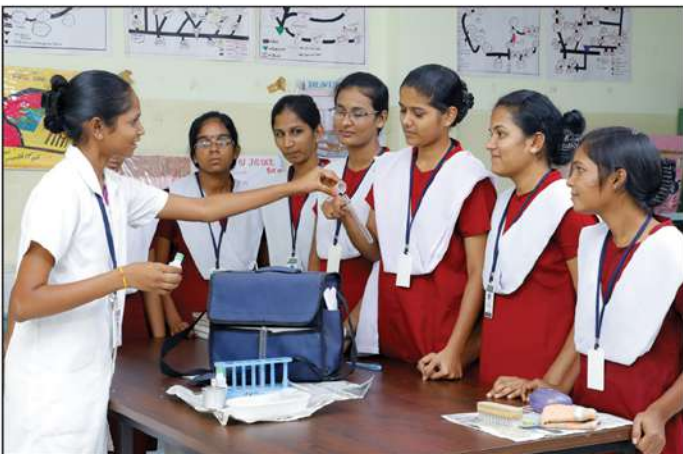
GENERAL MEDICIN NURSING LAB