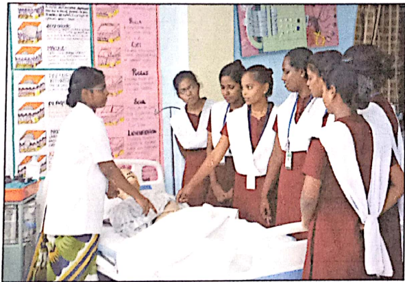
MEDICAL SURGICAL NURSING LAB