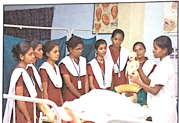
MATERNAL AND CHILD HEALTH NURSING LAB